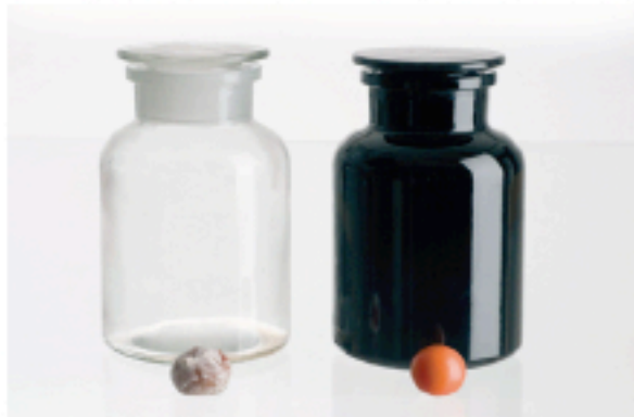
Clear Glass Violiv™ Glass

Cherry tomatoes in room light for 7 months!